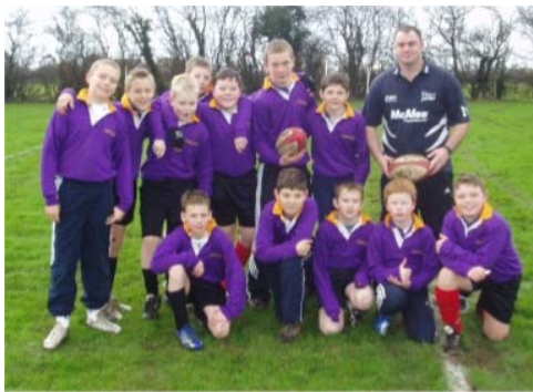
Year 7 Rugby Team

A return fixture v Brine Leas school saw the year 8 team defeat their opposition by 42 – 15 pts. A close 17 – 10 half time score represented a fair indication of the even play. However, after the interval Congleton took a firm control of the game and some expansive play earned the team this excellent victory. A number of new players managed to get on the score sheet for the first time. It was also the first game for our year 7 team. Faced by a more experienced opposition it took the boys a little while to “find their feet”. This was an opportunity to put into practice some of their skills and there were many encouraging signs as the game progressed. Unfortunately they were unable to convert pressure on the opposition into points.