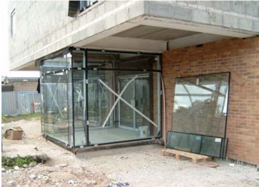
The windows are going in!!

Work is now progressing at a rapid pace on site with large numbers of different trades completing finishing touches to their work. Construction issues along the way have caused a few delays, but as the glazing is completed the internal fixtures can now be put into place. A selection of the new sixth form tenants have taken guide tours and wait with excitement for what will be a fantastic asset to Congleton High School. They are looking forward to using their own catering facilities, a light and spacious common room, and well equipped classrooms and study room.