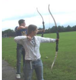
Various activities taking place during Engineering Week